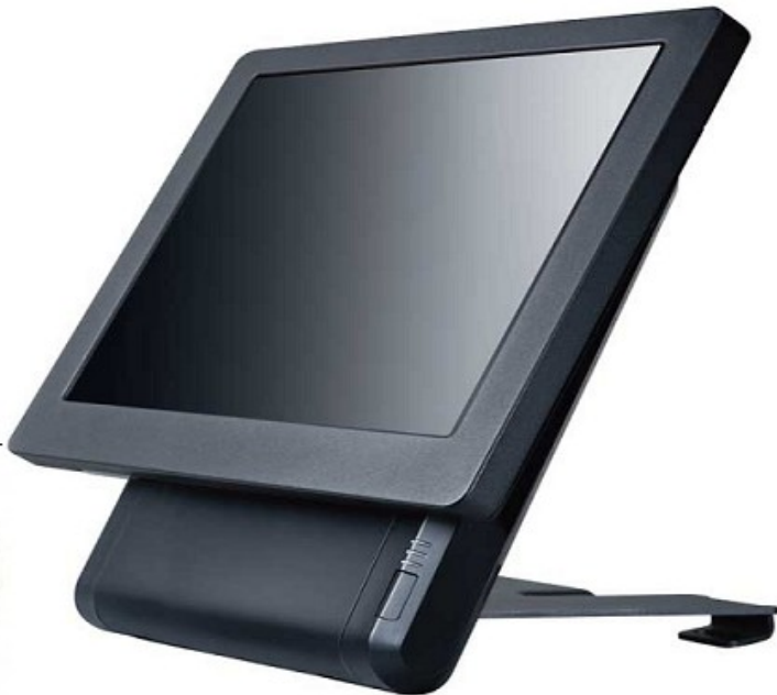
Hi-yota Touch System IT-7000