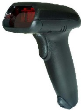
Laser Gun Scanner BS-915R