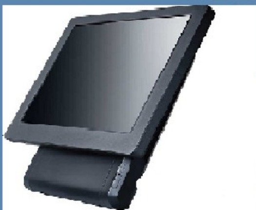
LCD 2nd Screen Display

The LCD advertising display provide you with a 24 hours non stop demonstration of your specials and newly arrival products which is a powerful way to influence the in-situ decision making of your customers.