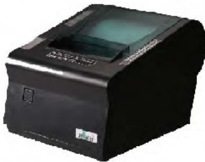
POS Printer BP-085R